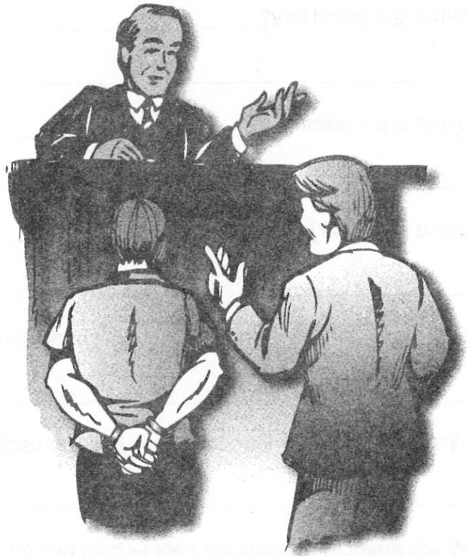
The Fourth, Fifth, and Sixth Amendments protect those accused of crimes.

In the Sixth Amendment, we are guaranteed the right to a fair, fast, and public trial. People who are accused of a crime also have the right to be present in court and have a lawyer represent them, even if they cannot afford one. The Sixth Amendment protects the rights of the accused.