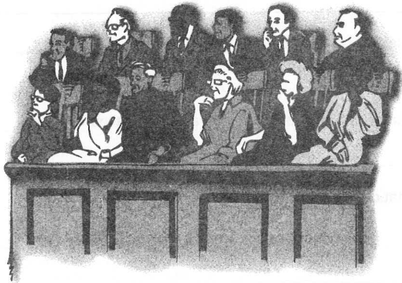
The Seventh Amendment guarantees the right to a trial by jury.

The Eighth Amendment protects us from having to pay excessive bail or be punished in cruel and unusual ways. Bail is money that is given in order to be released from jail. The money is returned when the accused appears in court for the trial. Protection from paying excessive bail means that one wouldn't have to pay one million dollars to be released from jail for stealing a candy bar!