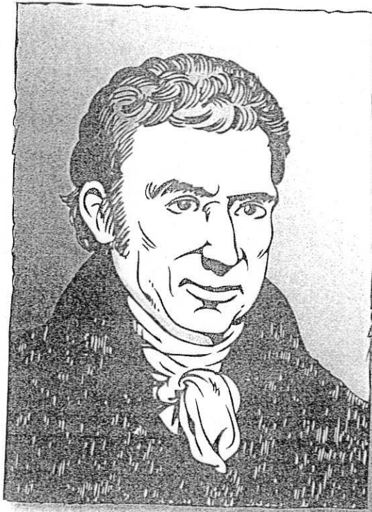
John Marshall, chief justice from 1801 to 1835, was responsible for broadening the powers of the Supreme Court, especially the power of judicial review.

To quickly review, we've seen the three branches of our Federal government. The legislative branch makes our laws, the executive branch carries out our laws, and the judicial branch defines our laws. There are many people who make our laws and help run our country, just as there are many who defend our rights and freedoms as Americans.